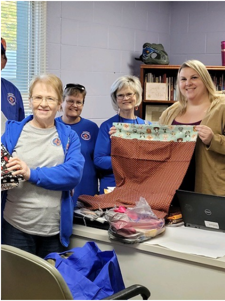
Field trip to Morningstar Mission in Joliet to present gifts and view for a possible work week in 2023.