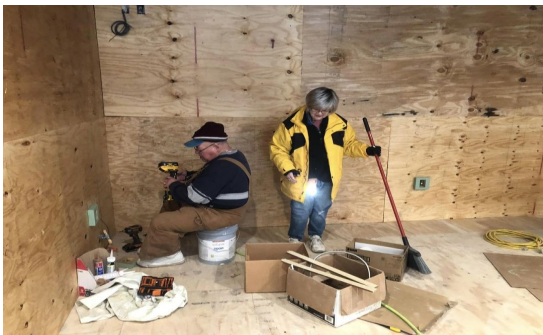
Work and fellowship done by the team in Texas