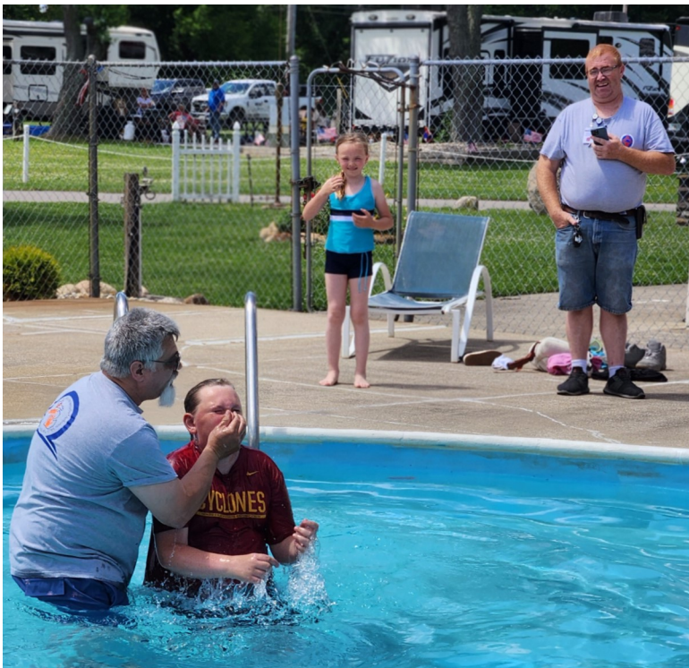
Baptism of 2 children from Iowa in the campground pool.

Several others also came to salvation and will be baptized in their home churches.