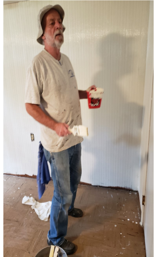
Painting, painting and more painting to change the dark wood walls to white and preparing the floor for new flooring. It looked nice when it was finished.