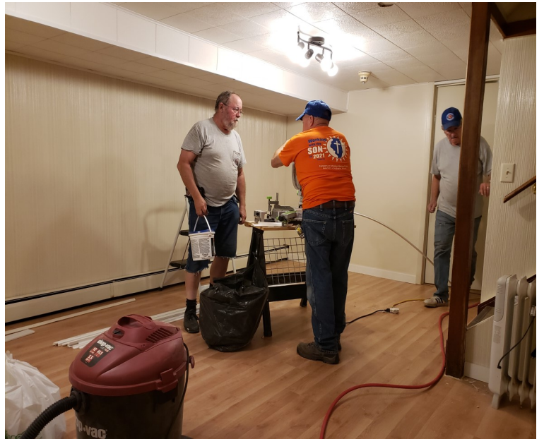
Living room walls, floors and ceiling looked a lot different from Monday until Saturday!!!