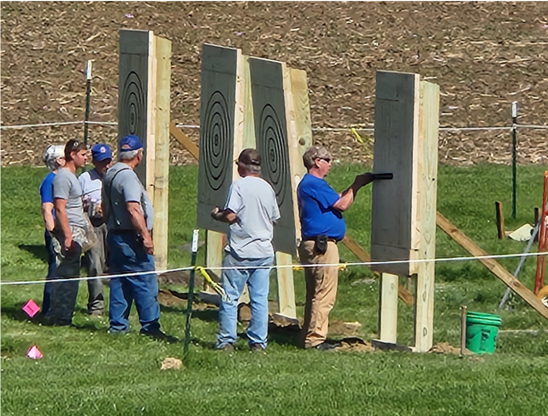
The team building the axe throwing targets and the group photo