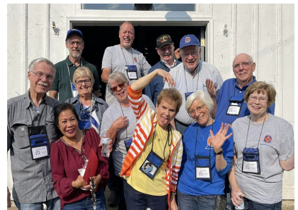
Line up of Presidents and state representatives presenting the flags