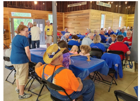
One of our many delicious meals served at National Rally.